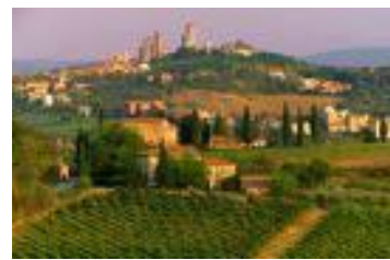
Medieval Town of San Gimignano