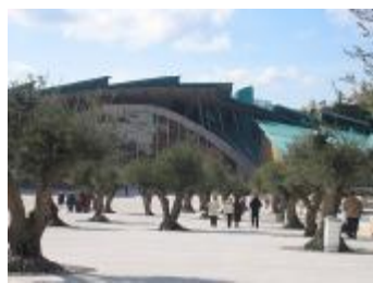
Shrine San Giovanni Rotondo