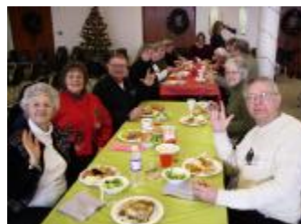
PICTURES FROM JACK MABLEY CENTER: DECEMBER 15, 2007