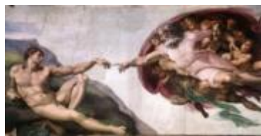
Sistine Chapel, Rome