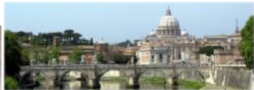
St. Peter's Basilica, Rome