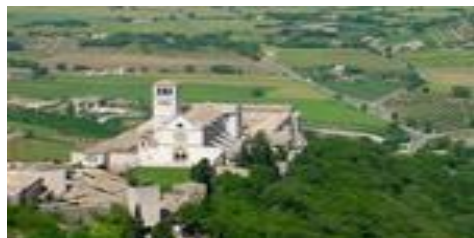
Basilica of St. Francis in Assisi