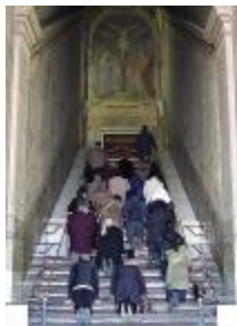
Holy Steps, Rome