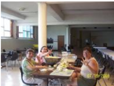
Yum Yum making some grub!