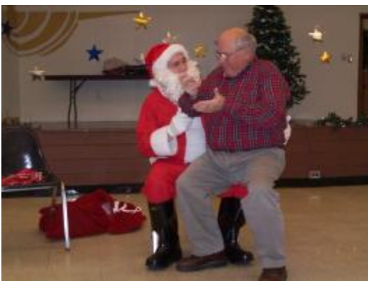
Thank You Mr. & Mrs. Claus For Another Great Christmas!