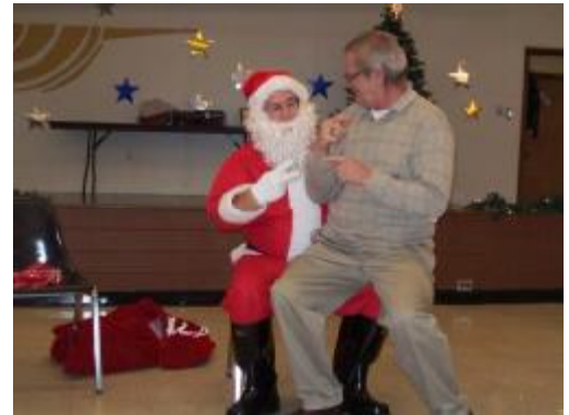
Your never too old to enjoy Mr. and Mrs. Santa Claus!