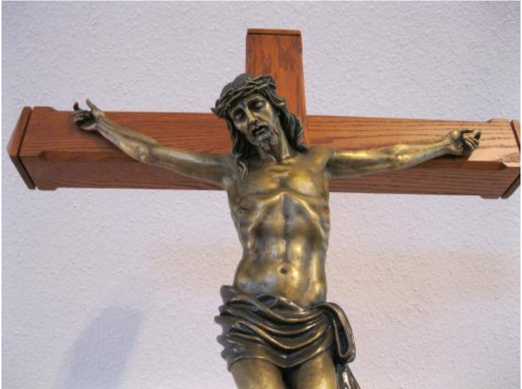
The Crucifix at Christ the Teacher Church in DeKalb

The next issue will have more information on the picnic and a Deaf Mass Schedule for July to December 2011.